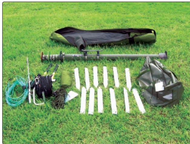
All accessories are stored in a heavy-duty rot-proof transit bag. Guy ropes are supplied on reels to prevent rope tangles and to reduce deployment and teardown time.